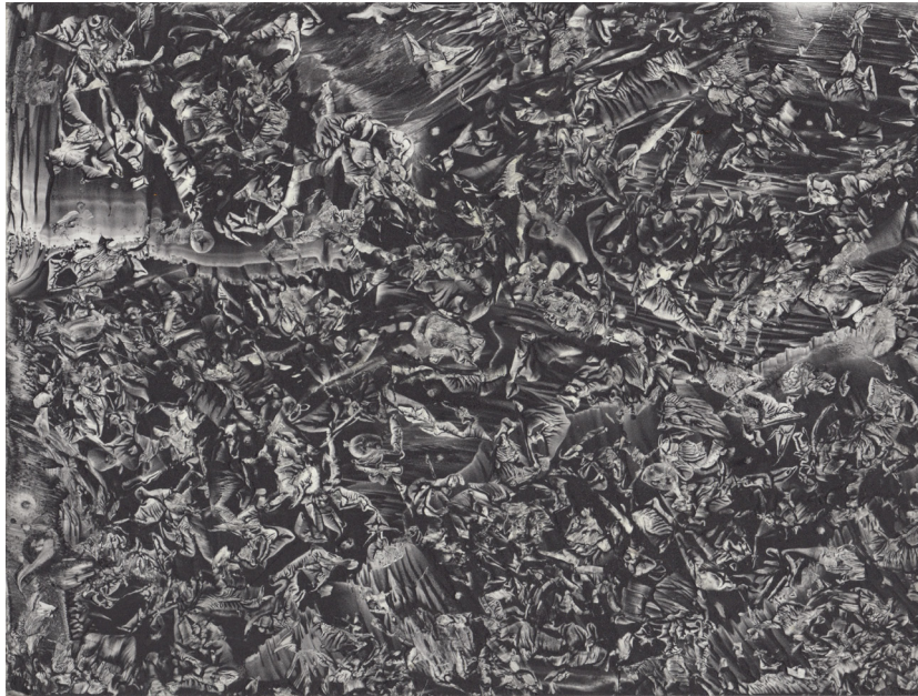
Sans Titre, (LFG6), Liquide Graphite on Paper, 46,4 x 54 cm / 18 1/4 x 21 1/2 in. (framed)

Born in Nice in 1944, Roland Flexner has lived and worked in New York (USA) since 1982.